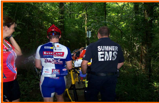
Bike Team Members assist EMS Medic 11 with treatment and extrication of patient from the woods.